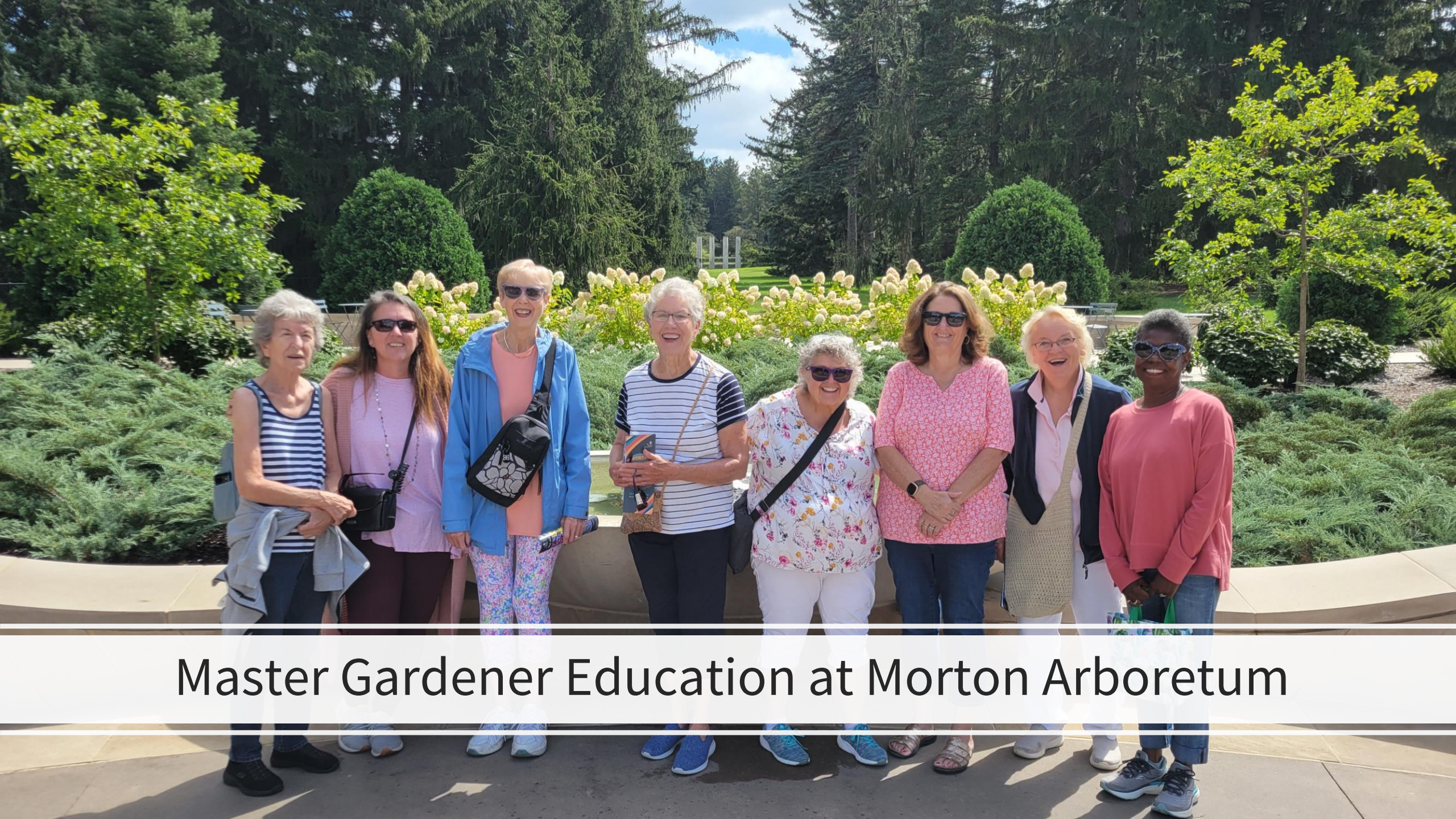
Master Gardener Education at Morton Arboretum